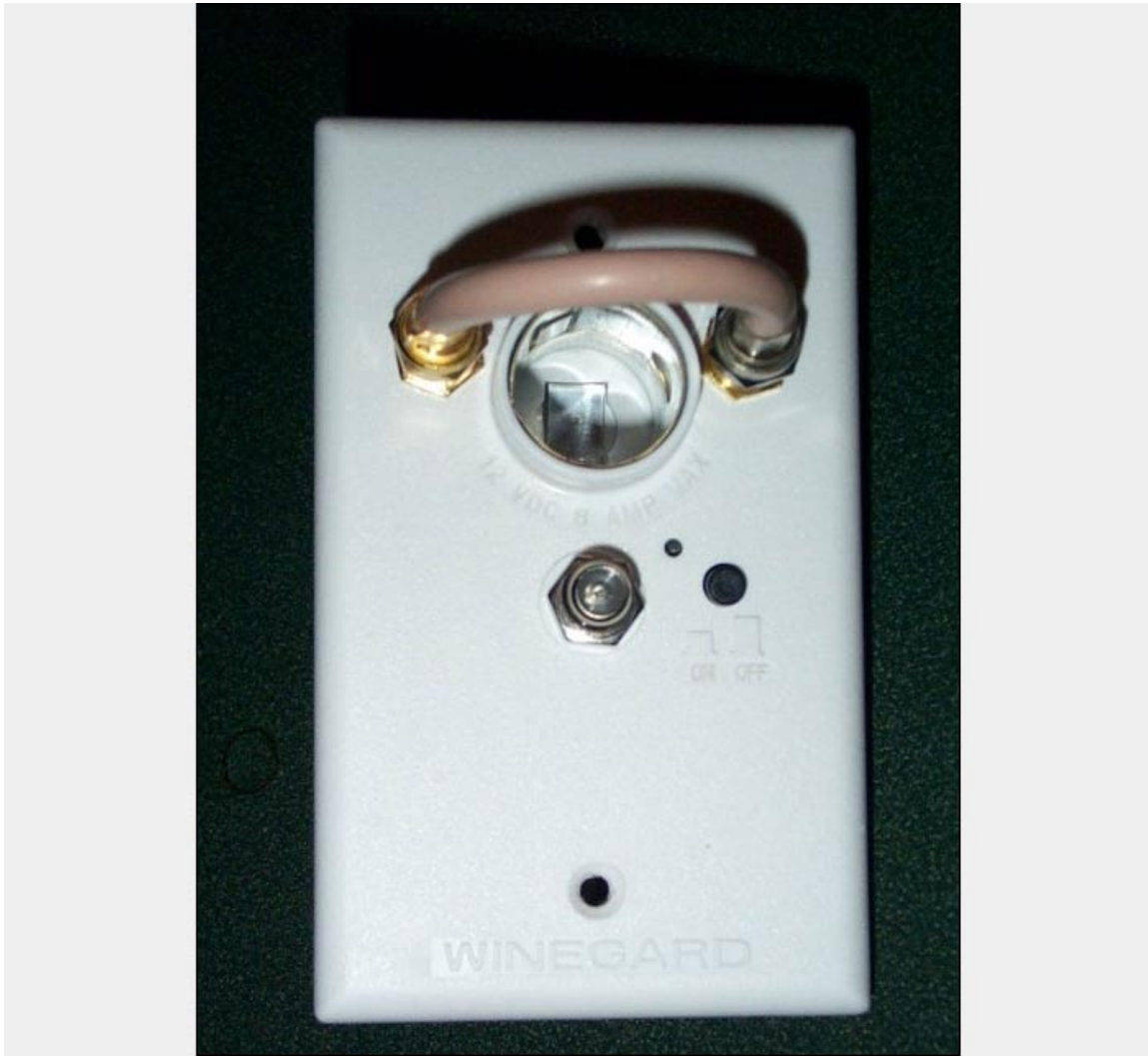
Campsite cable config. - Paul (nc_camper)

Description: A small jumper is required to allow the use of cable at a campsite as if the modification had not been made.